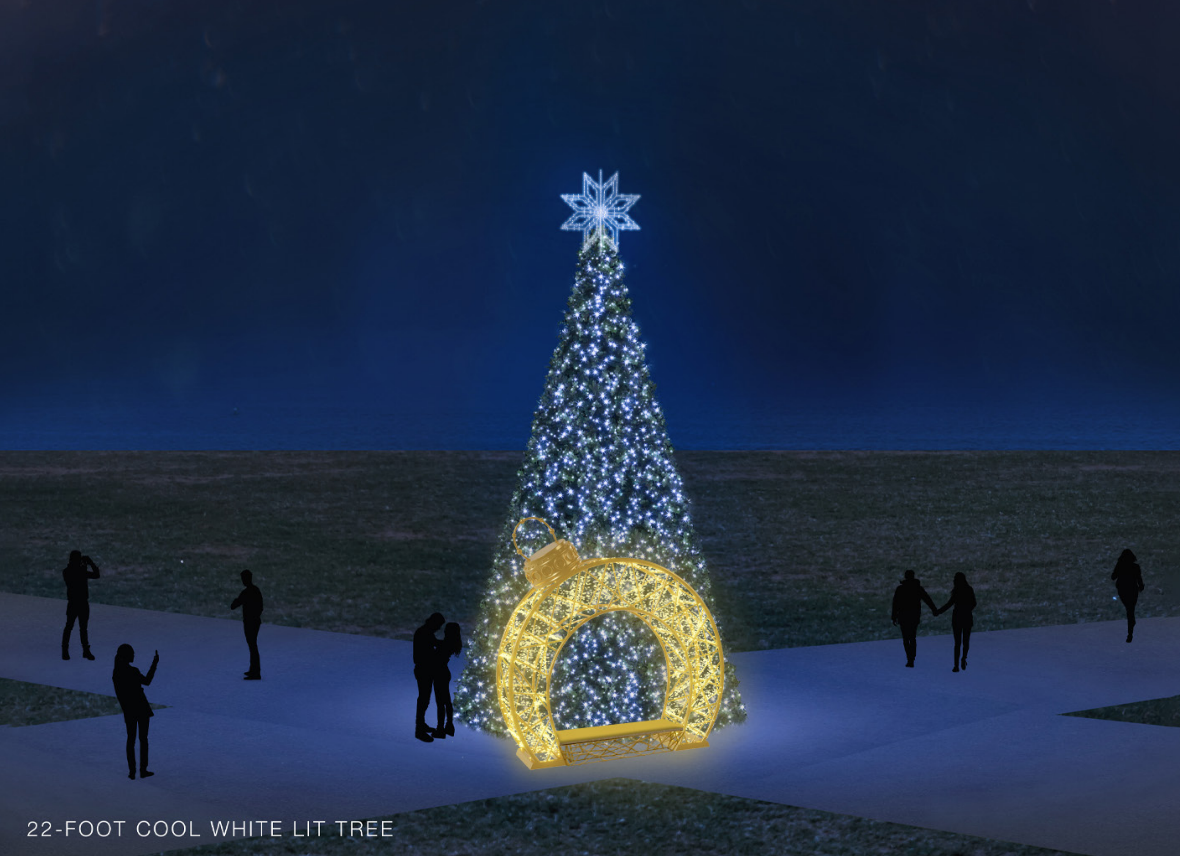
22-FOOT COOL WHITE LIT TREE