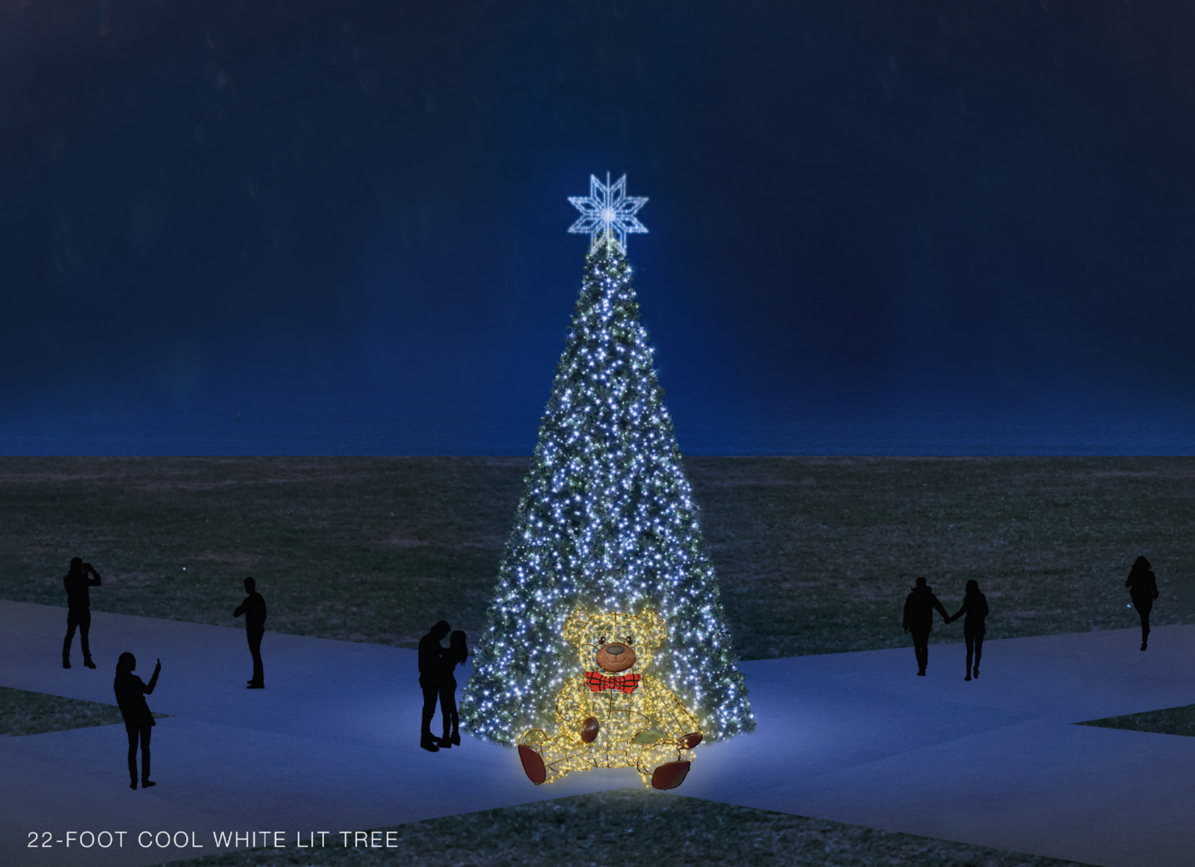
22-FOOT COOL WHITE LIT TREE